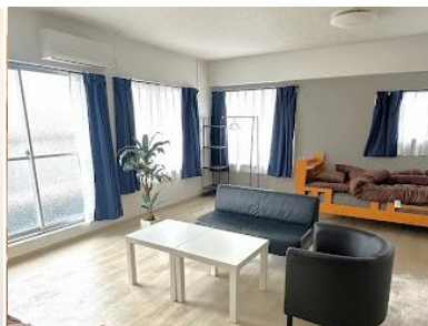
Largest private room