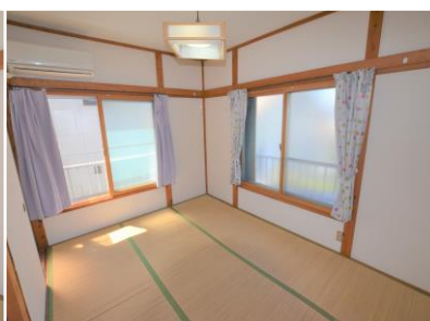
Room for two②