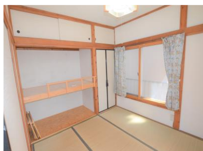
Room for two①