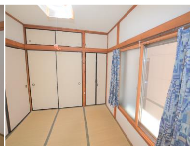
Room for two③