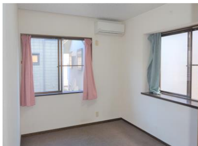
Room for two①