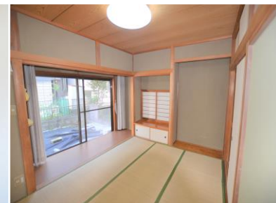
Room for three