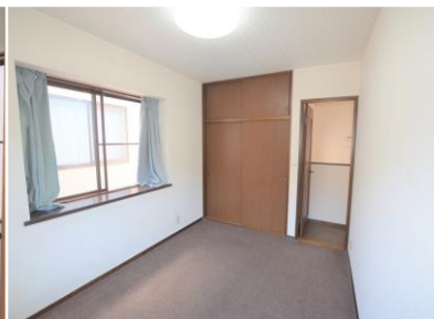
Room for two②