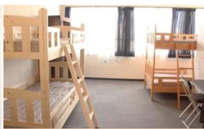
Room for four