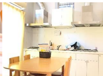
Kitchen & Dining room