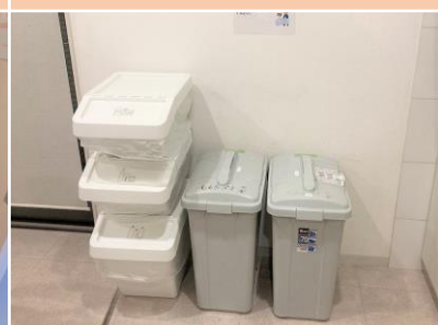
Sorting trash cans