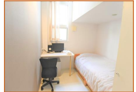
Private room Type-A

<Common> Lounge, Lavatory, Wash Basin, Shower room, Washing machine (¥200), Dryer(¥100/30min.), Large screen TV, Rice cooker, Microwave, Wi-Fi <Room> Bed (or Loft), Bedding, Air conditioner, Desk, Chair, Mini Refrigerator, Mini TV. Closet, Wi-Fi